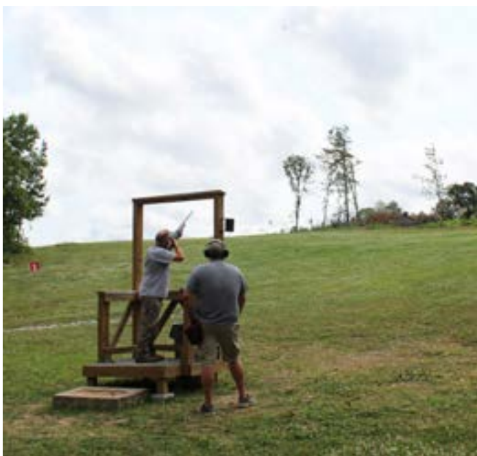
Top: Congratulations to our 1st place team from Legend Hollow.